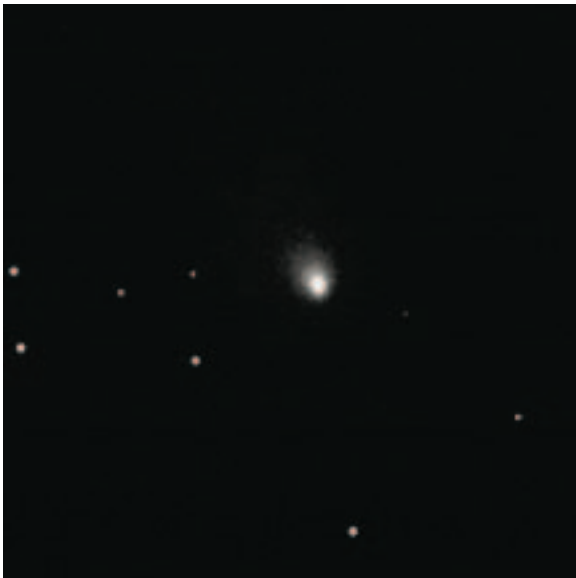
First image of Tempel 1 taken by the Impactor spacecraft after launch. 30 images composited from MRI camera.

But you can do it! Here’s what you’ll need: a telescope (more on telescopes later, in Part II); a star map or two which you can access here;