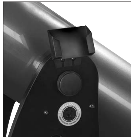
Figure 2. The controller holster installed.

Once the holster is installed, simply place the hand control into the holster, making certain that the cord does not get caught between the controller and the holster. You can leave the cord attached, and can even press the controller's buttons while it is in the holster. You may even find it convenient to simply leave the hand controller in the holster all the time. Be certain to remove and disconnect the hand controller before separating the telescope sections or moving the telescope.