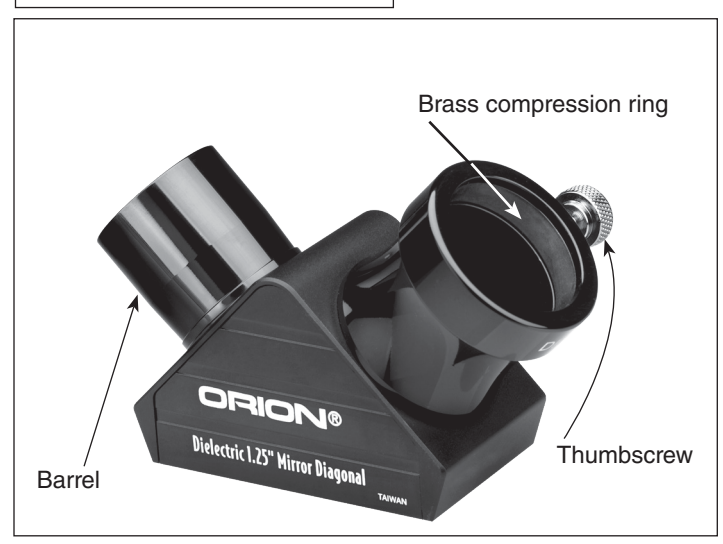
The Orion 1.25" High Reflectivity Mirror Star Diagonal

Focus with your telescope's focusing knob. The 1.25" diagonal requires approximately 9cm inward focus travel relative to the eyepiece's focus position without the diagonal. The 2" model will require slightly more inward focus travel, as it requires approximately 11cm relative to the eyepiece's focus position without the diagonal.