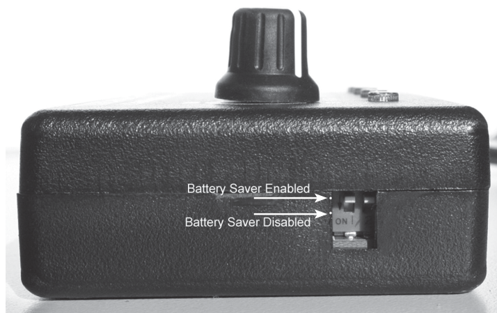
Figure 4. Move Switch 1 to the down position to disable the battery saver. Switch 2 is not used.

The battery saver can be disabled if you are using a dedicated power source. To disable the battery saver, move Switch 1 (located inside the small square hole on the left side of the control box) to the down position ( Figure 4 ). The down position is actually labeled "ON", which disables the battery saver. Switch 2 is not used.