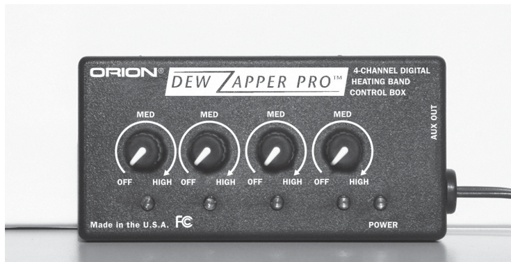
Figure 1. The Dew Zapper Pro control box.

Copyright © 2020 Orion Telescopes & Binoculars. All Rights Reserved. No part of this product instruction or any of its contents may be reproduced, copied, modified or adapted, without the prior written consent of Orion Telescopes & Binoculars.