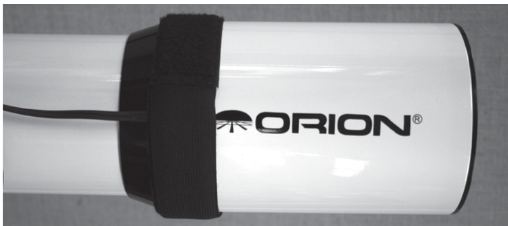
Figure 2. The installed heating band should have its power cord extending away from the lens.

When using the smaller 4" and 6" heating bands on eyepieces, the heating band should be wrapped around the body of the eyepiece. The power cord should face downward away from the eyepiece lens.