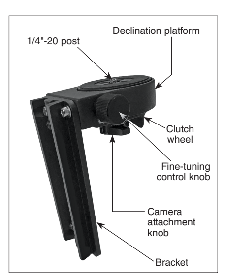
Figure 1. Features of the Declination Bracket for StarShoot CAT

To attach the optional Declination Bracket to the StarShoot CAT just slide it into the StarShoot CAT's saddle, then tighten the Saddle Lock Knob to secure it in place. Then attach your camera to the padded declination platform's ¼"-20 post by turning the Camera Attachment Knob clockwise to thread the post into the ¼"-20 receptacle on the bottom of your camera until tight.