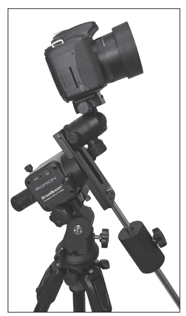
Figure 5. The declination platform can be removed and replaced with the Ball Head Mount.