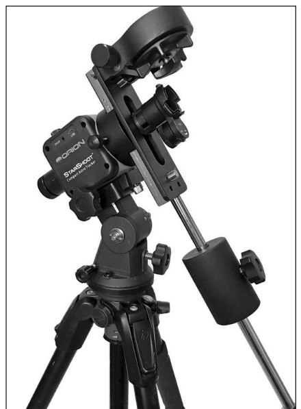
Figure 3. The combination of the Dec Bracket and optional Counterweight and Shaft allows proper counterbalancing of telescope or camera payloads.