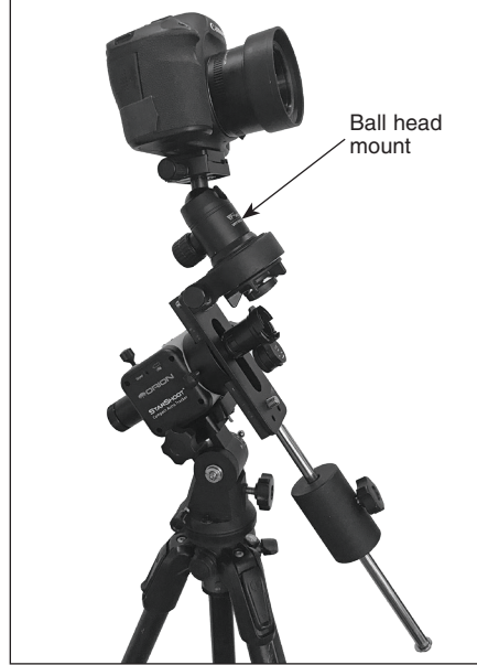
Figure 4. Mounting the Ball Head Mount to the declination platform allows greater freedom for pointing the camera.