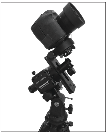
Figure 2. Polar alignment of the StarShoot CAT can be performed with the Dec Bracket installed.