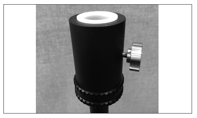
Figure 6. Thread the U-mount pier onto the top of the elevator shaft and tighten until snug.