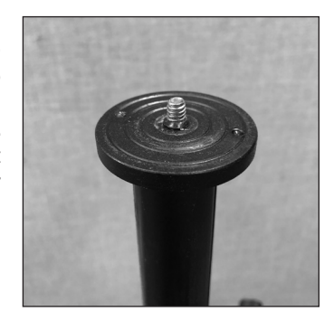
Figure 3. The head has been removed, revealing a ¼"-20 threaded post.

a secure connection. Once the tripod has the sleeve insert installed, remove the pier section of the U-mount by loosening the large azimuth tension hand knob (figure 1) and slipping