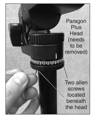
Figure 2. Loosen the two allen screws in order to remove the Paragon Head from the elevator shaft.

Figure 4 and figure 5 show installation of the threaded sleeve insert on top of the ¼-20 tripod stud. Please install this threaded insert on the tripod first, before attaching the U-mount on top, in order to verify