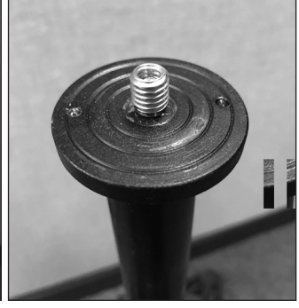
Figure 5. The 3/8"-20 sleeve installed.