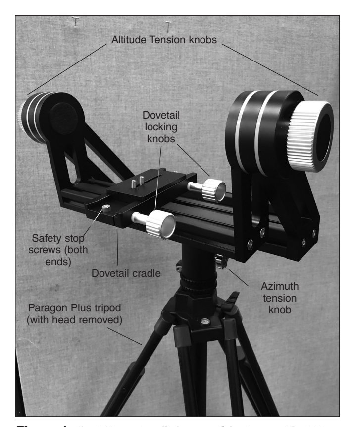
Figure 1. The U-Mount installed on top of the Paragon Plus XHD tripod.

U-Mount 3/8"-16 to 1/4"-20 sleeve insert Paragon Plus Tripod (in package #22115 only) Instruction manual